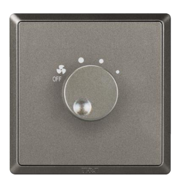
HC4201MMD - ST5